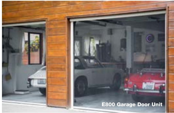
E800 Garage Door Unit

* Size limitations on Solar Control Next 5. See store associate for details.