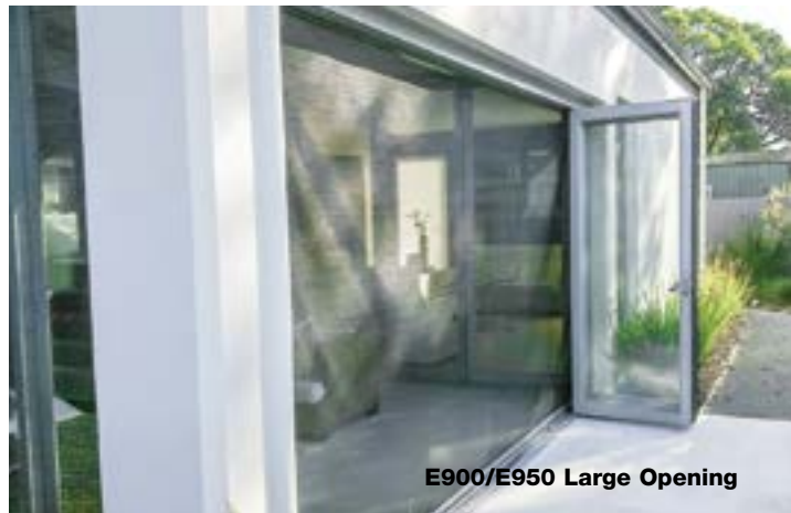
E900/E950 Large Opening