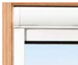
Screen disappears into cassette