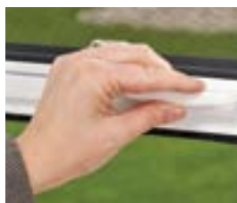
Quiet operation retractable screen